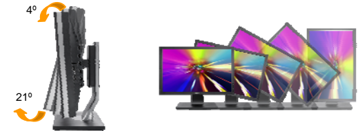
3) Tilt (4° Forward and 21° Backwards) 4) Pivot