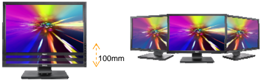
1) Height Adjustment 2) Swivel (45° Left and Right)