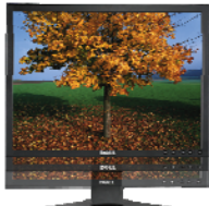
1) Height Adjustment